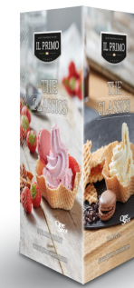
TABLE TENT CARD

Dimensions: 42 cm Width x 59,4 cm High For 18 flavour cards & 3 general cards