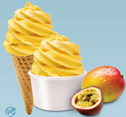
MANGO & PASSION FRUIT